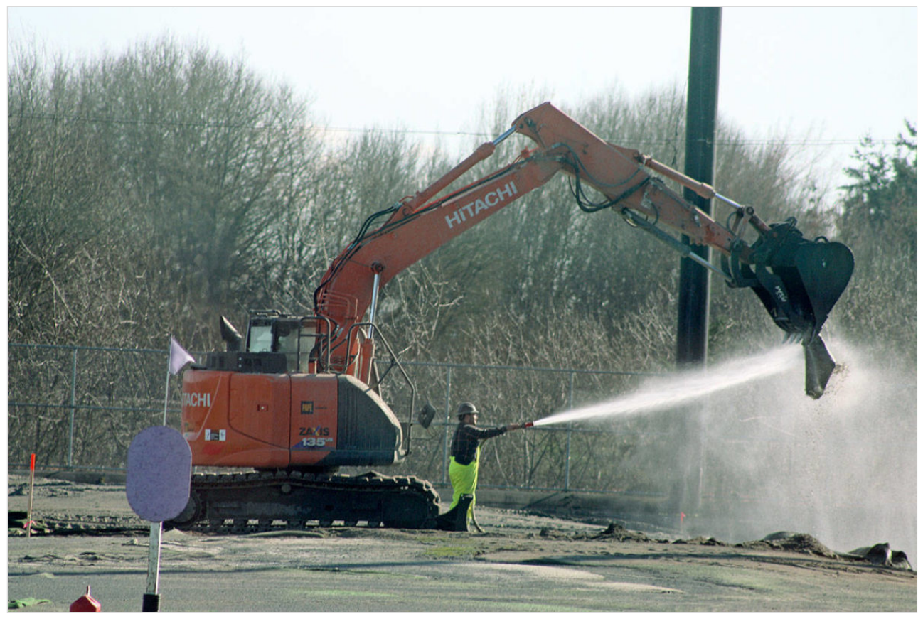
Crews work Tuesday to remove old artificial turn from the Riverbend Driving Range.